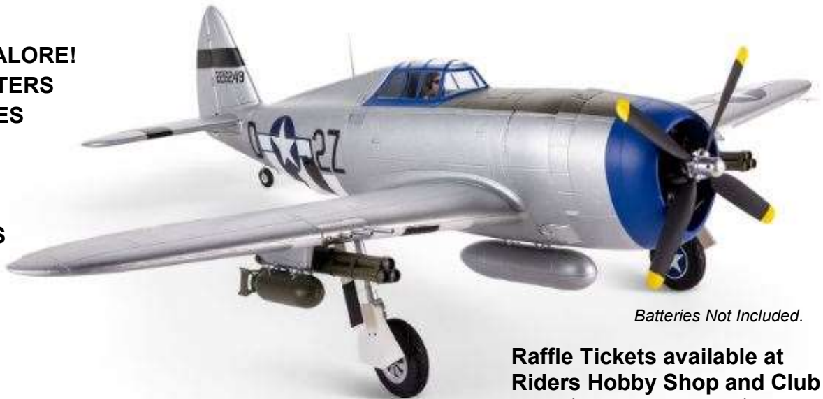
Batteries Not Included.

Raffle Tickets available at Riders Hobby Shop and Club Events Only $1 each or 6 for $5